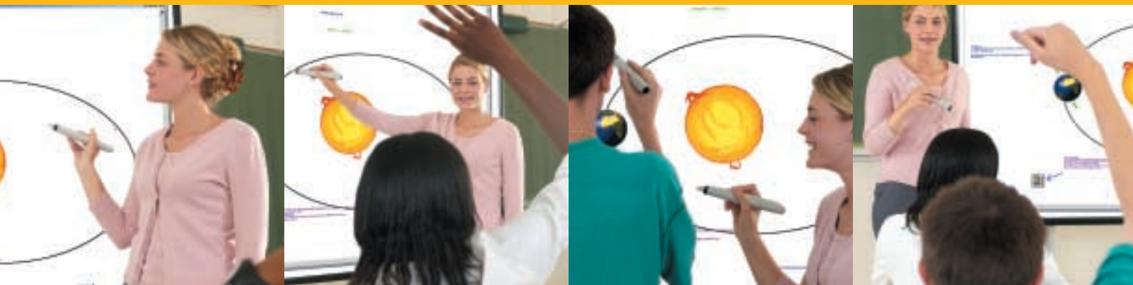
High school math teacher controls images on the InterWrite SchoolBoard in front of class. Students solve problems interactively.