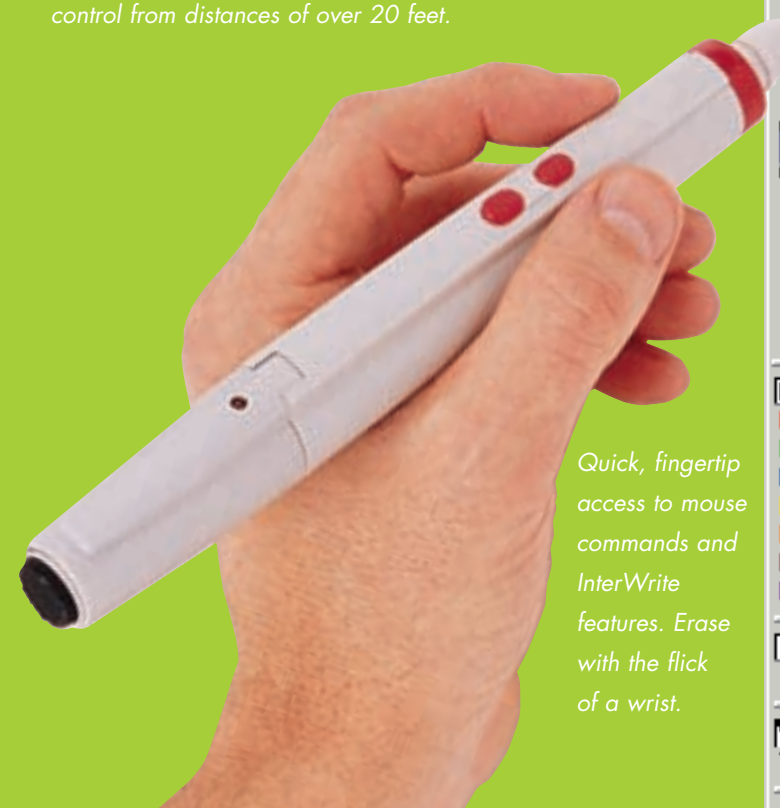
Quick, fingertip access to mouse commands and InterWrite features. Erase with the flick of a wrist.