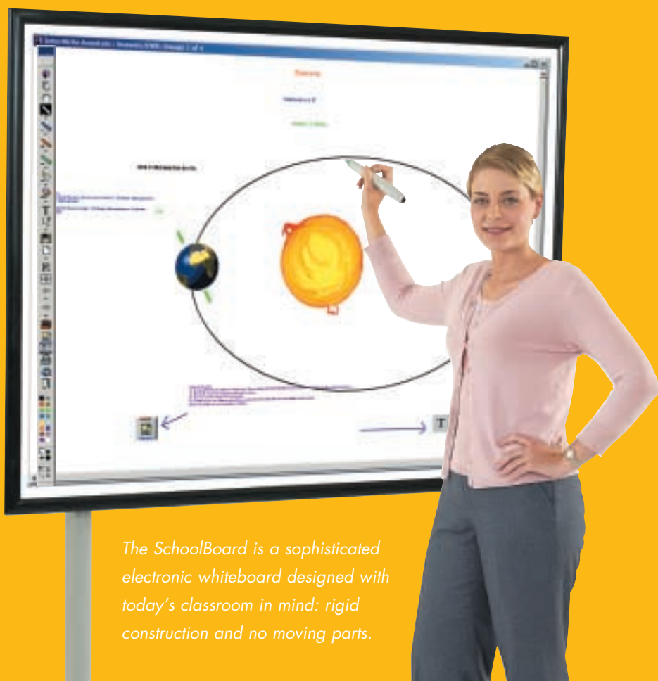
The SchoolBoard is a sophisticated electronic whiteboard designed with today's classroom in mind: rigid construction and no moving parts.

Start your lesson...now! With the wireless SchoolBoard, using Bluetooth technology, classrooms can be wire-free and require no set-up time.