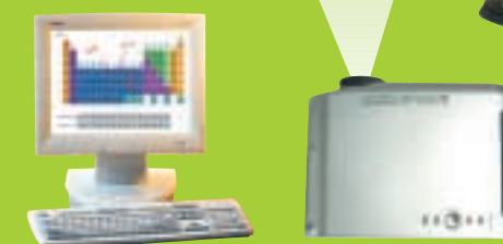
InterWrite SchoolPad: You can project images on any surface or on the InterWrite School Board and maintain control from distances of over 20 feet.