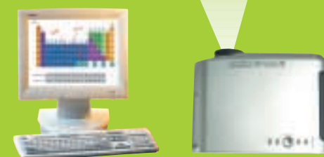
InterWrite SchoolBoard: Projected images from any computer program can be controlled by simply touching the toolbar or by using the InterWrite pens.