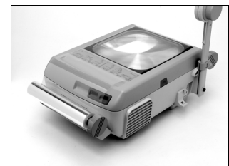
#2298 Roller Attachment and STY50 Write-On Film